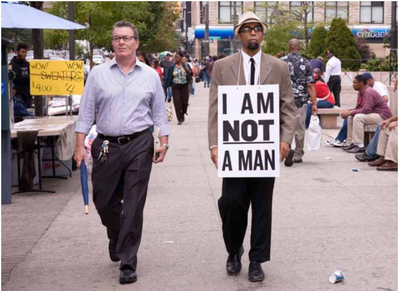
IMAGE: Dread Scott, I Am Not A Man, 2009, pigment print, 22 x 30 in., Edition of 5 (#1/5)